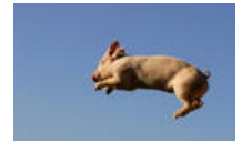
When Pigs Fly