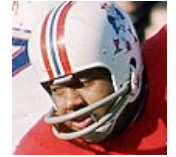
SI's Classic New England Patriots Photos