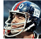
SI's Classic New York Giants Photos