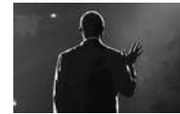
LIFE Waves Goodbye